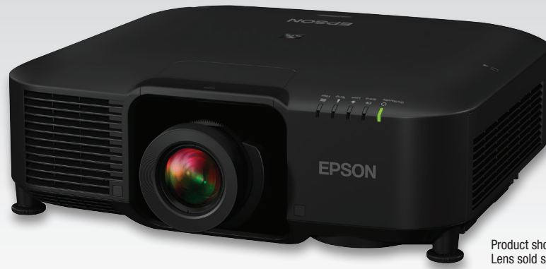
Product shown with lens. Lens sold separately.